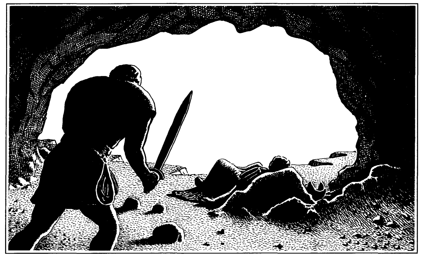
David quietly crept from the back of the cave to cut a piece of cloth from Saul's robe.

We can see from Saul's example how dangerous anger and jealousy can be. It is important that we all learn to control our tempers and emotions. Many people have been hurt or killed because of jealousy and hatred. We should try to follow David's example, and not the example of King Saul.