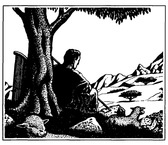
David returned from the king's palace to continue caring for his father's sheep.