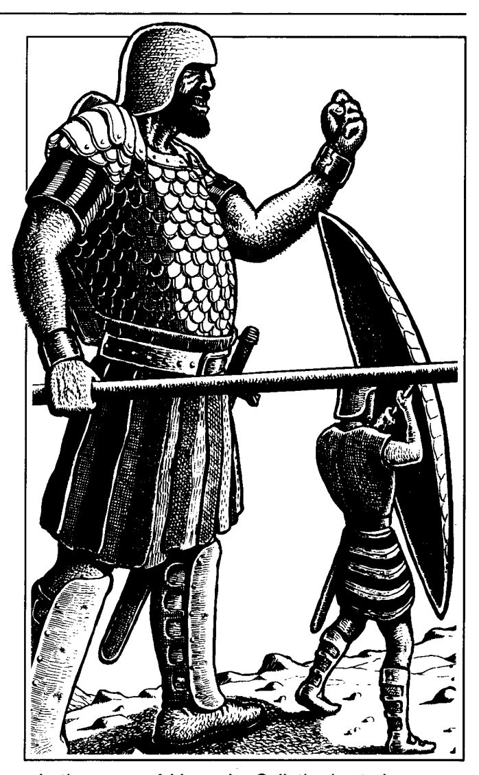
In the name of his gods, Goliath shouted curses and threatened to feed David's dead body to the birds and beasts.

What was David's reply to Goliath? (Summarize I Samuel 17:45-47.) David, with his youthful ability and