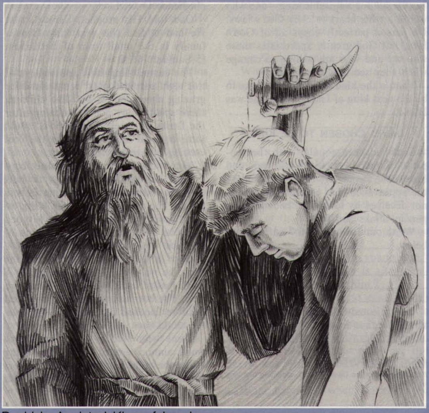
David Is Anointed King of Israel